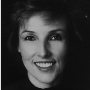
BELLA VF GAGARIN

origin // mid 16th century: alteration (probably by association with accompany) of Middle English complice 'an associate', via Old French from late Latin complex, complic- 'allied', from com- 'together' + the root of plicare 'to fold'.