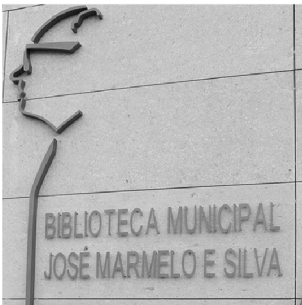
BIBLIOTECA MUNICIPAL JOSÉ MARMELO SILVA

Espinho, Portugal bibliotecamunicipalespinho.blogspot.com